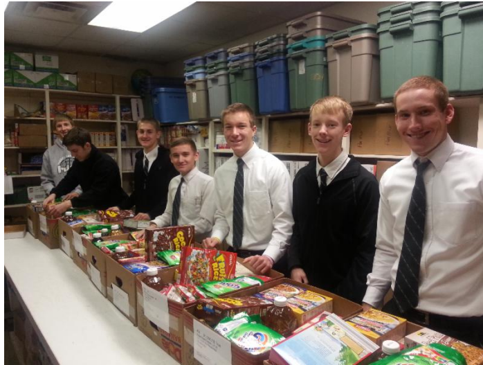
The Fisher Catholic boys soccer team assisting in assembling food boxes at St. Vincent de Paul.