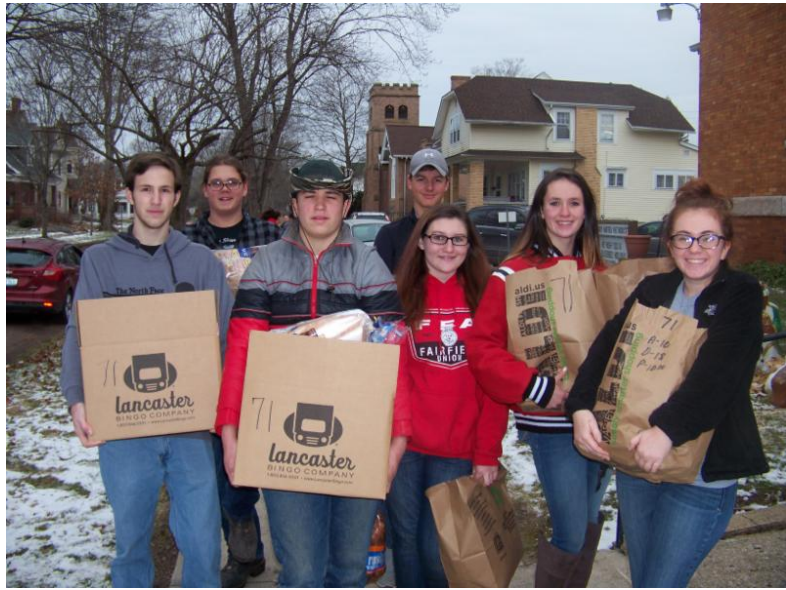
Fairfield Union High School students deliver items from the Bremen Food Pantry.