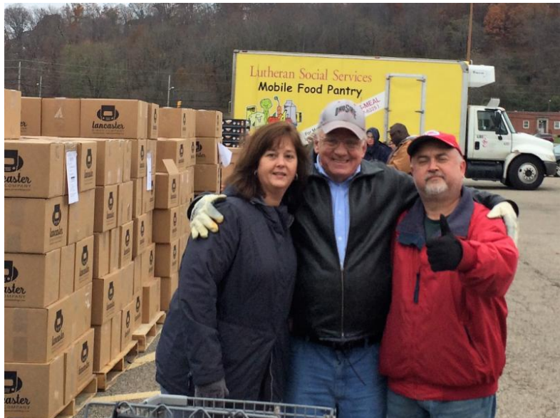
Volunteers for Lutheran Social Services preparing holiday boxes.