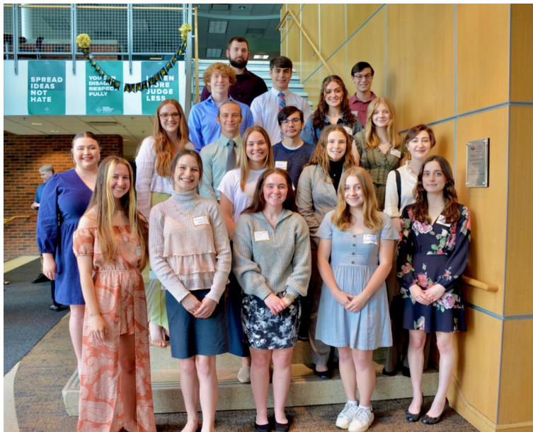
Scholarship recipients in attendance at the Rotary Scholarship Award Reception.