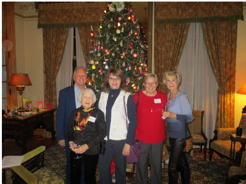
Final Video in Foundation's 30 Year Celebration Video Series